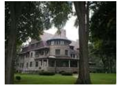
Copshaholm, Oliver Mansion